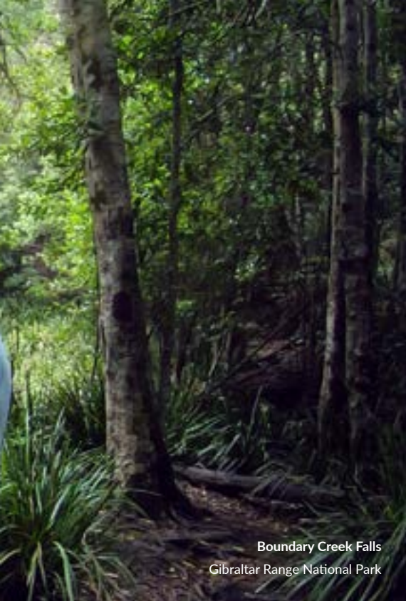
Boundary Creek Falls Gibraltar Range National Park