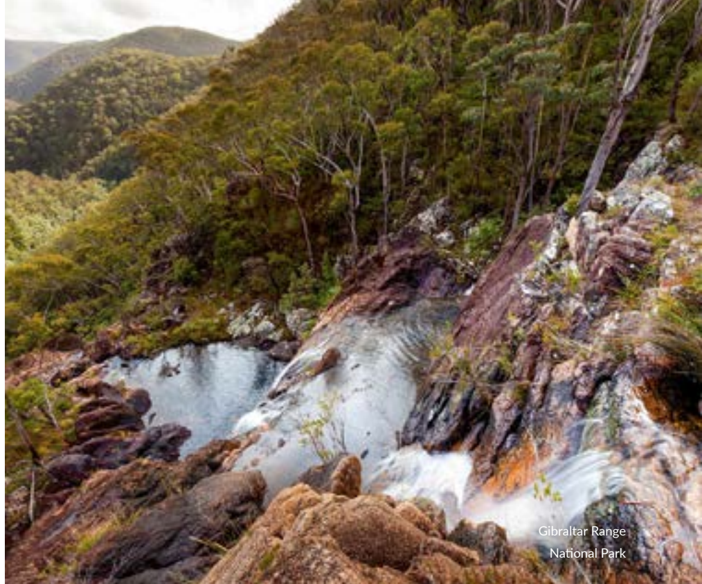
Gibraltar Range National Park