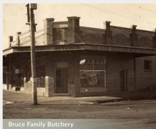
Bruce Family Butchery

This building has always been a butchery and early photographs show the sign writing of 'The New England Meat and Sausage Co'. Country people in earlier days mostly butchered their own meat but in town the butcher's boy would be seen riding around on his bike taking orders and returning later with the meat wrapped in butchers' paper. The lack of refrigeration meant that meat had to be purchased on a daily basis.