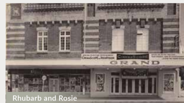
Rhubarb and Rosie

Warley and Co. opened a General Goods store on this site in c1904 but it closed in 1923. In 1925, E.E. Lightfoot and Son converted the building to a 700-seat picture theatre named the Grand. It is a fine Edwardian two-storey polychrome brick corner cinema building. There is a distinctive parapet line with moulded terracotta. The Grand closed in the early 1980's having survived longer than the smaller Roxy Theatre, now the site of McDonalds, that closed in 1960.