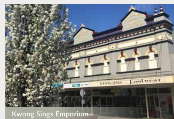
Kwong Sing Emporium