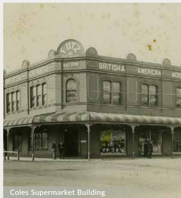
Coles Supermarket Building

Turn right at Bourke Street and walk to Church Street (New England Highway).