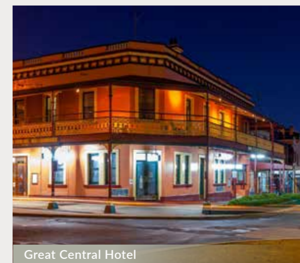
Great Central Hotel