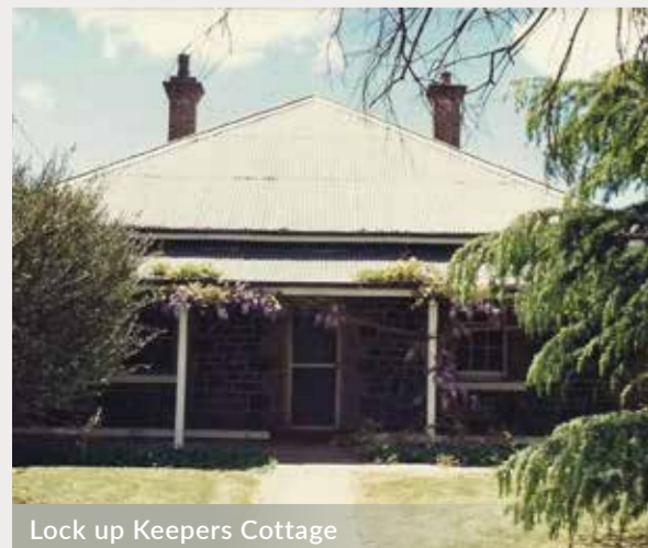
Lock up Keepers Cottage