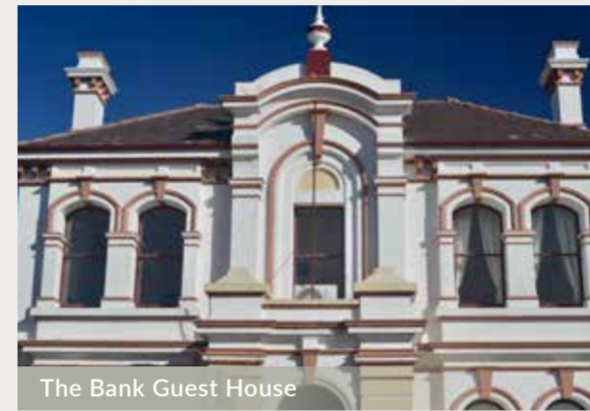
The Bank Guest House