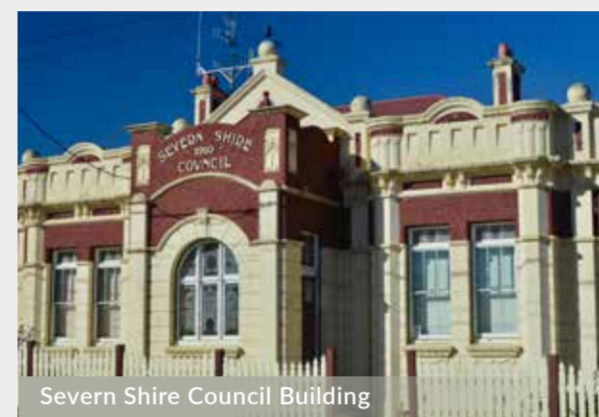
Severn Shire Council Building

Originally the Glen Innes Municipal Council, formed in 1872, looked after the whole district and the Severn Shire Council was only established in 1906. The chambers were built in 1910 at a cost of £997. It is a simple building of brick with elaborate render parapet façade. The fence has been reconstructed to match existing remnants shown in early photographs.