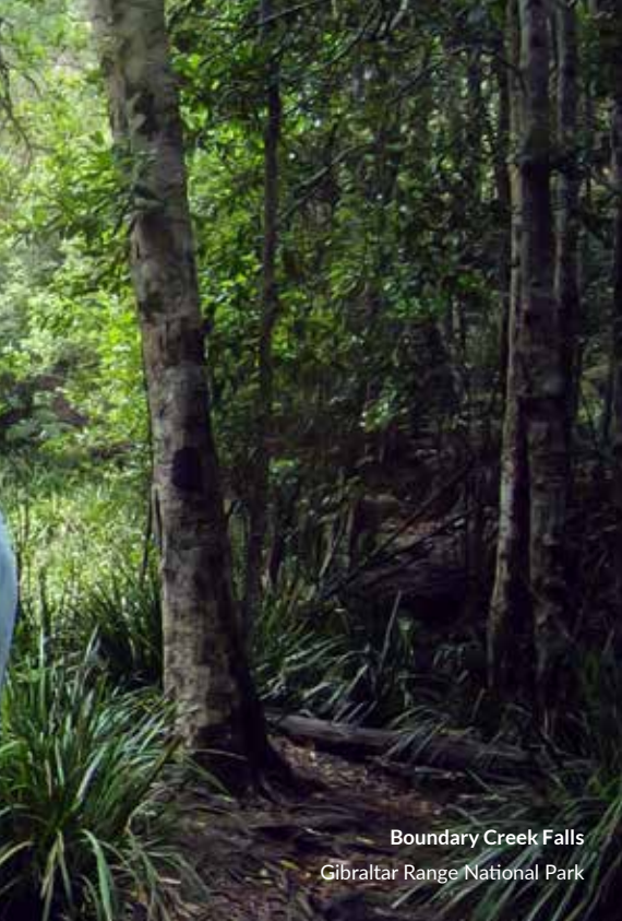
Boundary Creek Falls Gibraltar Range National Park