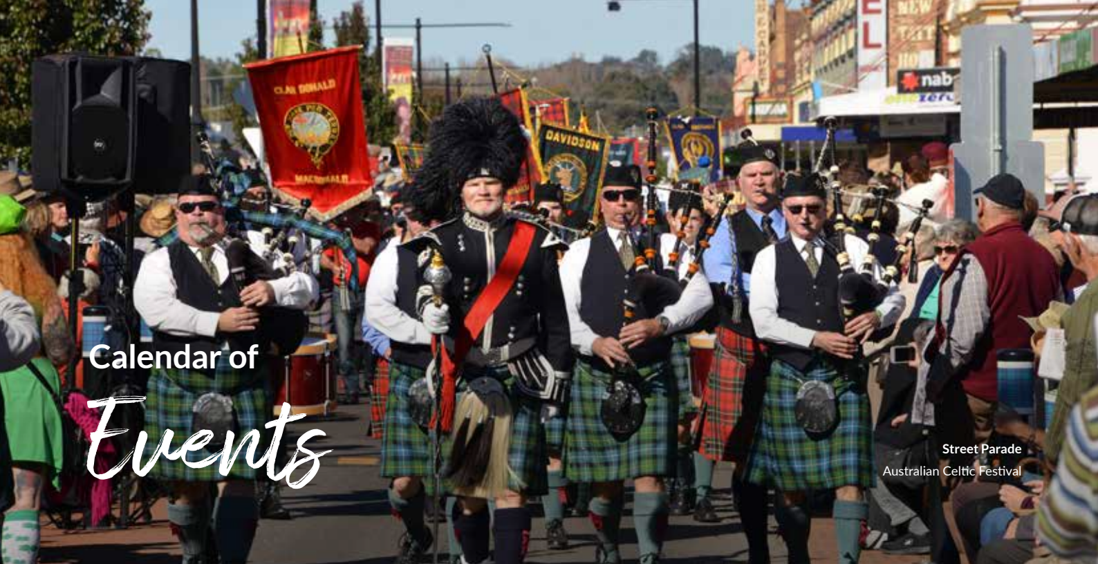
Street Parade Australian Celtic Festival