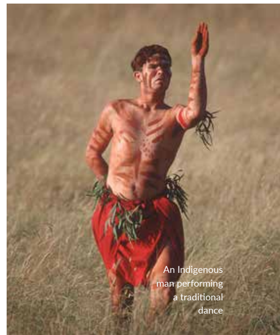
An Indigenous man performing a traditional dance