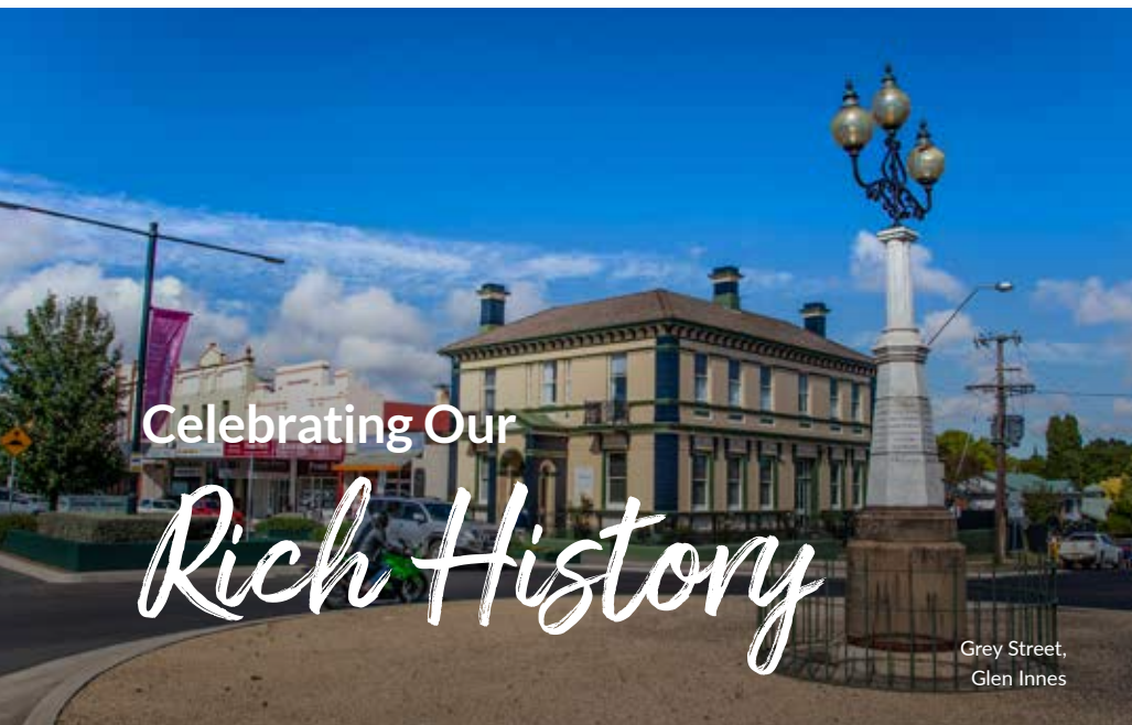
Grey Street, Glen Innes