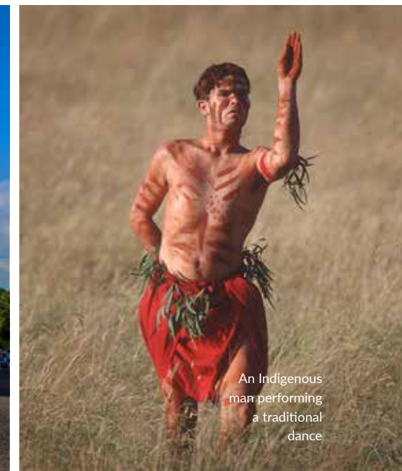
An Indigenous man performing a traditional dance

Emmaville Mining Museum, 45km northwest of Glen Innes, recalls the village's past as a late-19th century tin mining boom town which attracted thousands of European and Chinese miners. The museum has an extensive mineral collection, replicas of a mine and blacksmith's shop, rare photographs and a nostalgic general store and military display room.