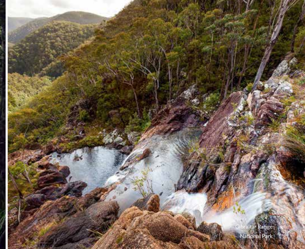
Gibraltar Range National Park