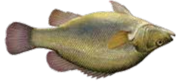
Golden Perch (Yellowbelly)

Legal length: n/a Daily limit: 5 Possession limit: 10 Open fishing season: all year