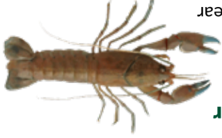
Yabbies - Freshwater

Legal length: n/a Daily limit: 200 Possession limit: 200 Open fishing season: all year