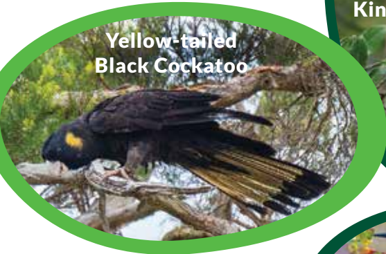
Yellow-tailed Black Cockatoo