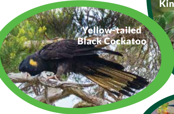
Yellow-tailed Black Cockatoo